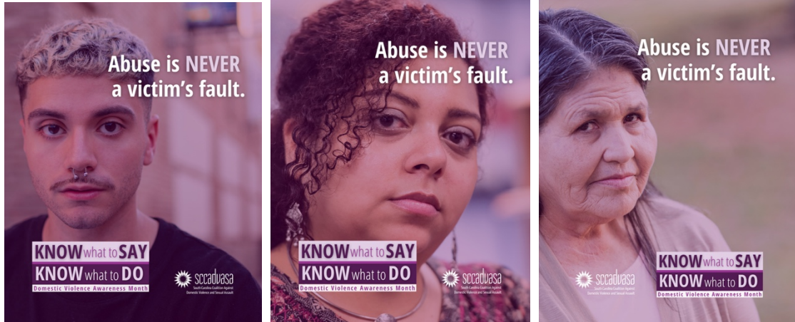
[ALT 1: A man with short blond hair and a mustache wears a nose ring and looks ahead while standing outside with text that says, “Abuse is NEVER a victim’s fault.” DVAM Know What to Say, Know What to Do and SCCADVASA logos]