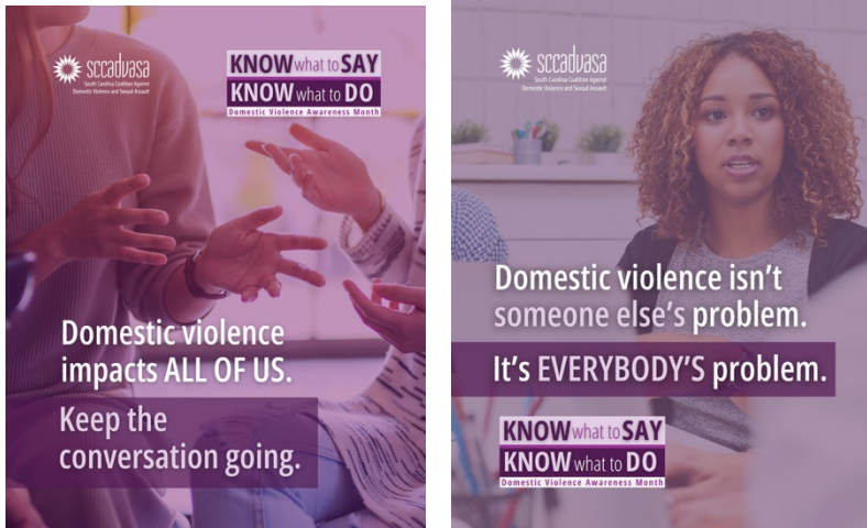
[ALT 1: Image of the hands of two women gesturing in conversation with text that says, “Domestic violence impacts ALL OF US. Keep the conversation going.” DVAM Know What to Say, Know What to Do and SCCADVASA logos]

creating a #ViolenceFreeSC. Learn more: sccadvasa.org/dvam #DVAM #KnowWhatToSay #KnowWhatToDo